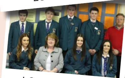
LCA1 Class Group