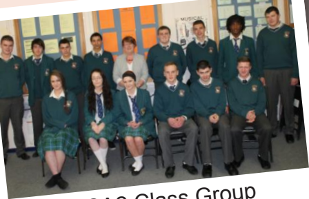
LCA2 Class Group